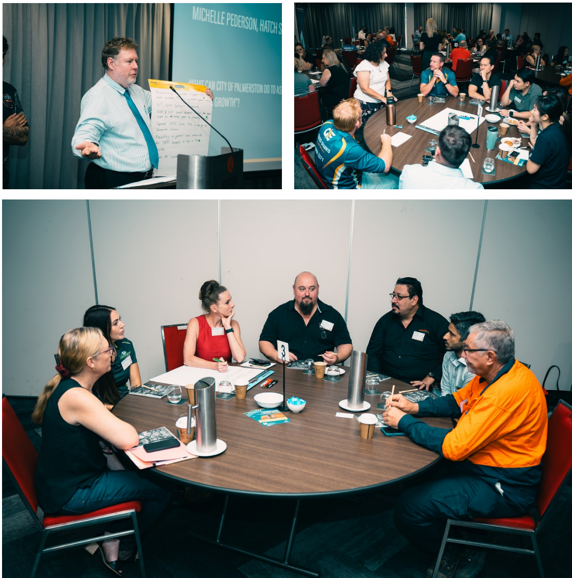
Palmerston Business Futures Forum was held on 20 November 2024

Participants were encouraged to explore the central question: “ What can City of Palmerston do to assist business and economic growth? ”. This theme set the tone for the day, fostering a sense of shared purpose and energising participants to engage in identifying tangible actions. The outcomes of these discussions were both insightful and actionable, providing clear direction for Council to incorporate into future strategic planning.