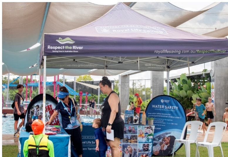
Royal Life Saving Society NT – Stall