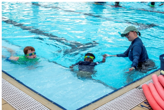
Belgravia Leisure – Swimming lessons

The second of the two (2) education sessions, run by Belgravia Leisure, involved a hands-on water-based activity with several stations demonstrating different water rescue techniques. To encourage attendees' participation, City of Palmerston offered the chance to win two (2) x $250 vouchers to anyone that took part.