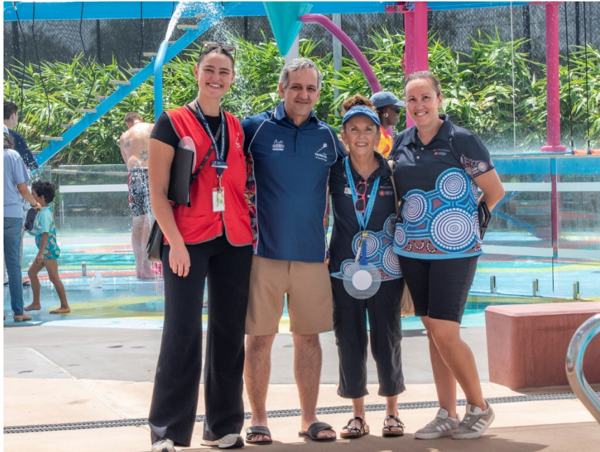
City of Palmerston and Royal Life Saving Society NT

Another AQUAFEST event is planned for 2025.