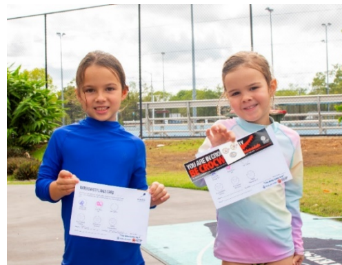
Water Safety Lakes Participation