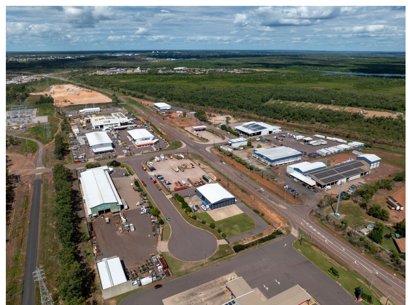
Wishart Industrial area