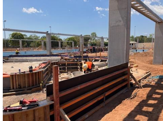
First structure complete for leisure pool and shade structure steel above columns 06/09/23