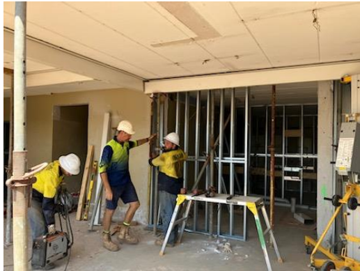
Partitions and structure commenced in amenities area 06/09/2023