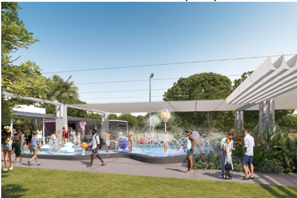
SWELL Leisure Area

SWELL Flyover link: https://youtu.be/SSt2YshbCfE