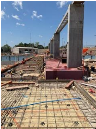
Formed coloured concrete step between 50m and program pool 06/09/23