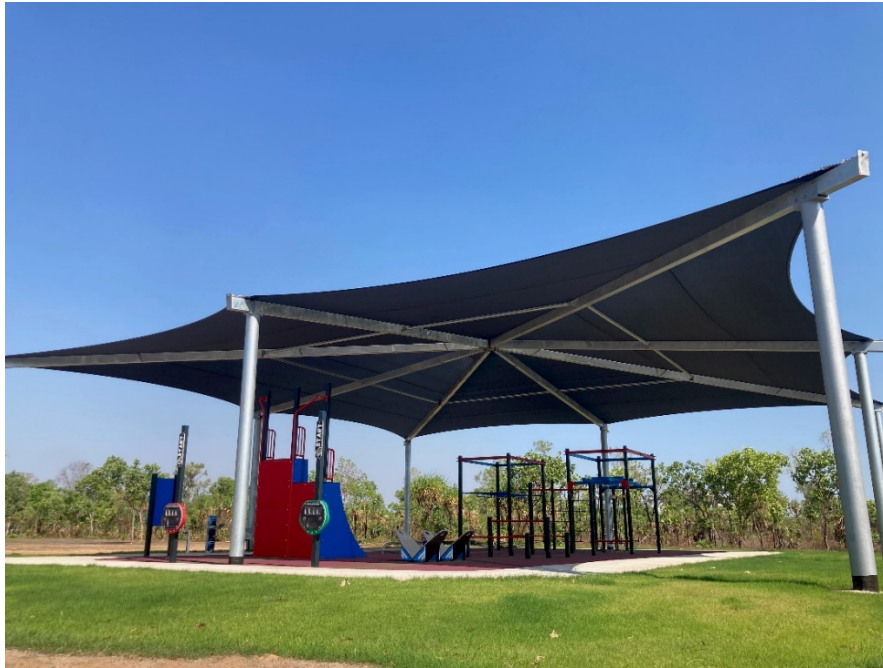
Completed Hobart Park Ninja Obstacle Course