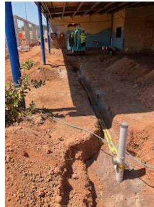
Dinning area in groiund services works commenced 06/09/2023