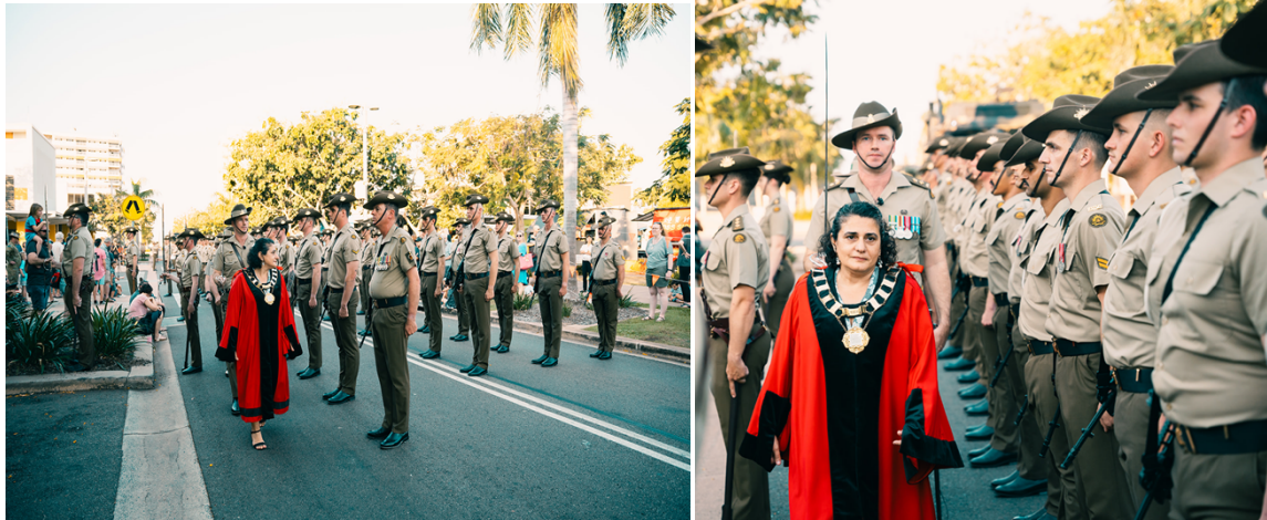
Mayor of Palmerston inspecting 8 th /12 th Regiment Royal Australian Artillery with CO

The troops were then inspected by Brigadier Foxall and the Mayor.