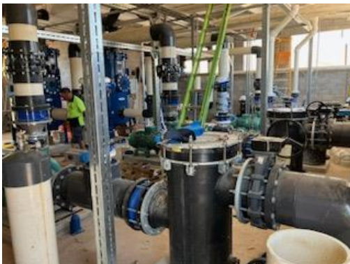
Plant room equipment 70% complete 06/09/2023