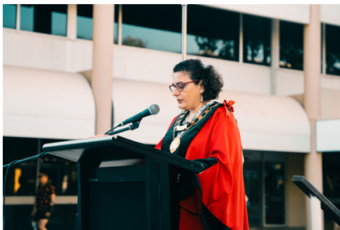
Mayor of Palmerston's address

Followed by the Mayor addressing the Regiment and Community