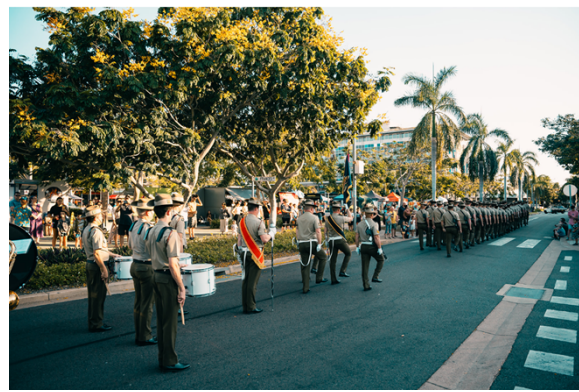
Regiment Marching into the City with the CO halting the parade in readiness for the Inspection