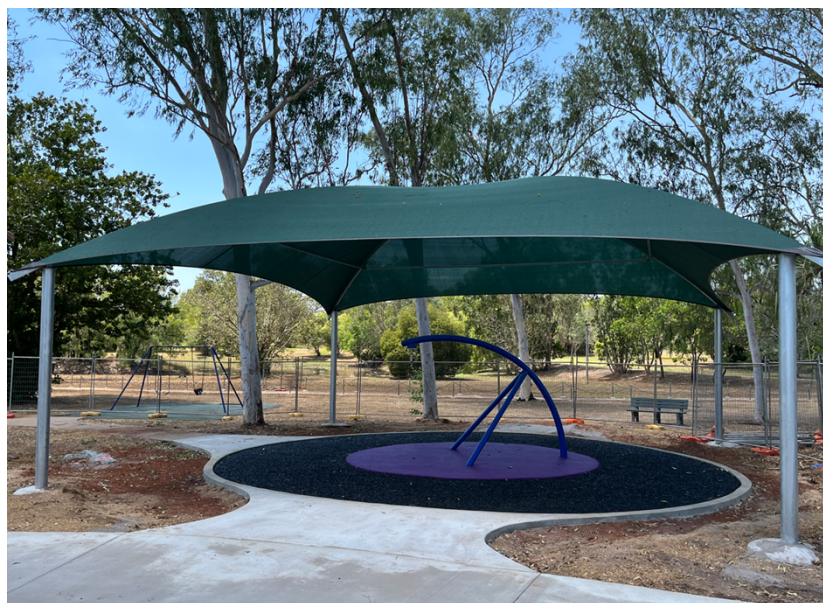
All Abilities Swing at Marlow's with new rubber softfall, shade and improved pathway access under construction and refurbishment

Council recognise and thank the Federal Government for co-contributing to the funding of this project.