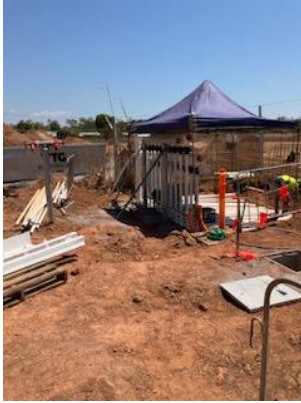
Commencement of manifold distributor 06/09/23