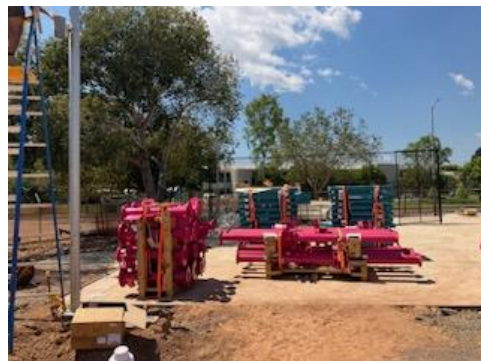
First delivery of Adventure Playground equipment 06/09/2023