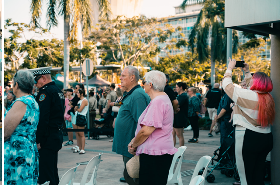
Palmerston Community, Veterans and Dignities