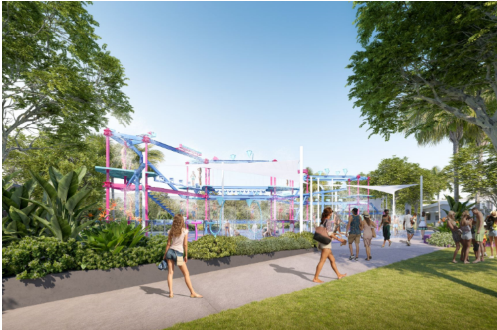
SWELL Adventure Water Play Facility: