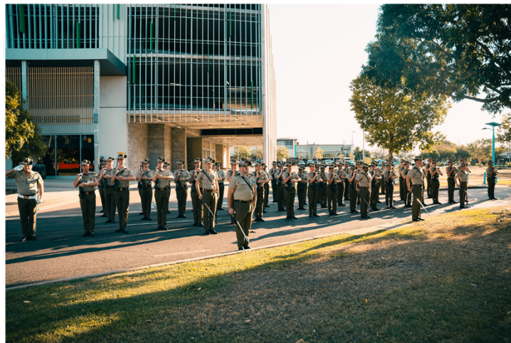
Troops Forming Up before the Parade

On Friday 22 September 2023 at 5.30pm, the Parade began with the Regiment forming up and commencing the march from Palmerston Circuit, proceeding to turn right on to