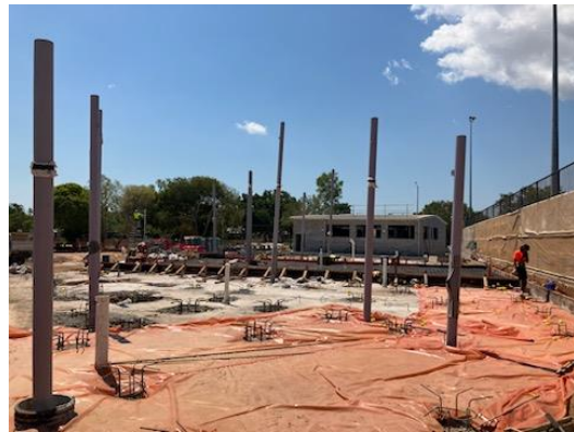
Ground structure and shade columns for adventure play area 06/09/23