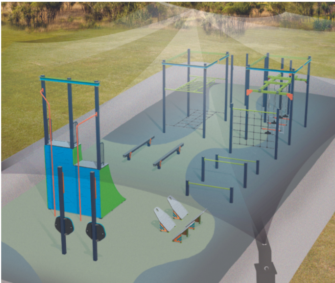
Hobart Park Ninja Obstacle Course Play Elements