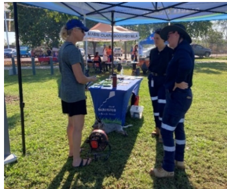
Rangers engaging with the Community at RSPCA Million Paws Walk