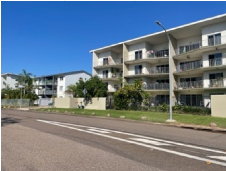
Mannikan Court Bakewell with new streetlight