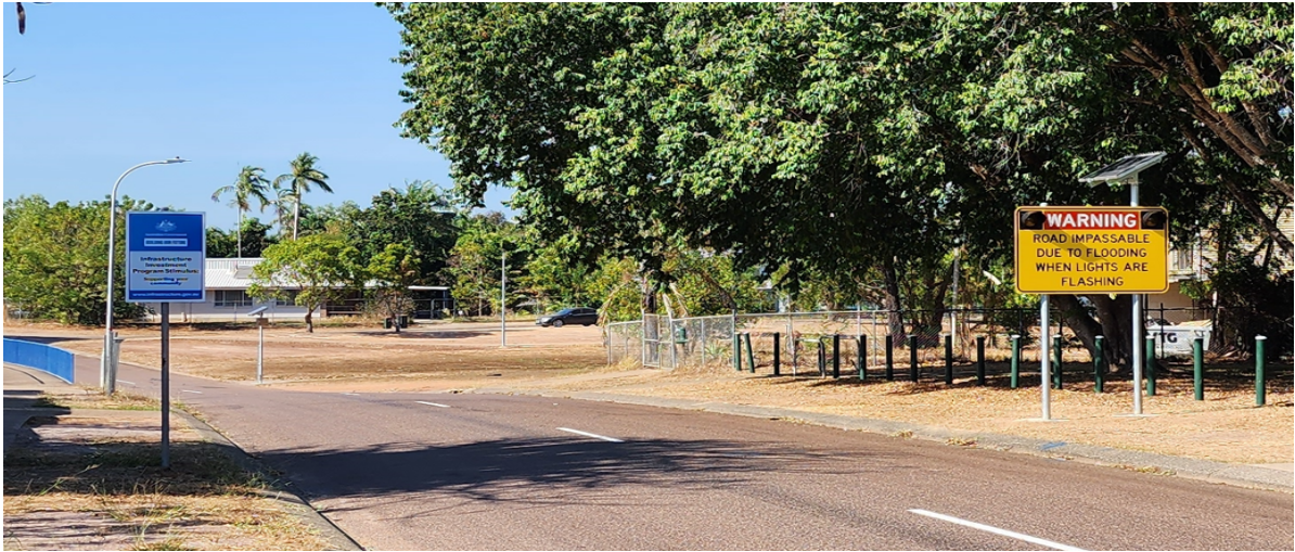
Floodway signage for Bombax Street, Moulden