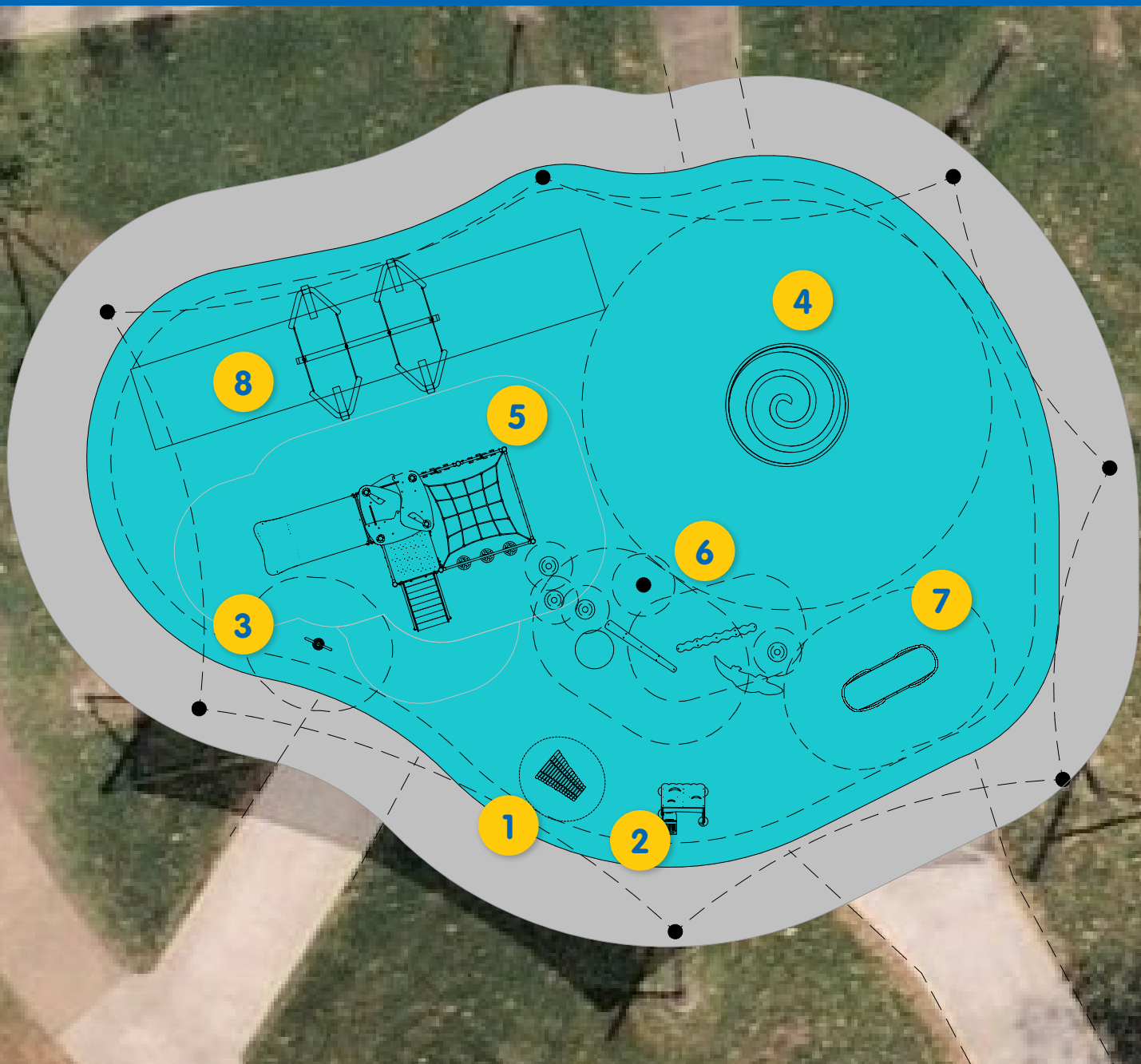
1. Percussion Play Cavatine