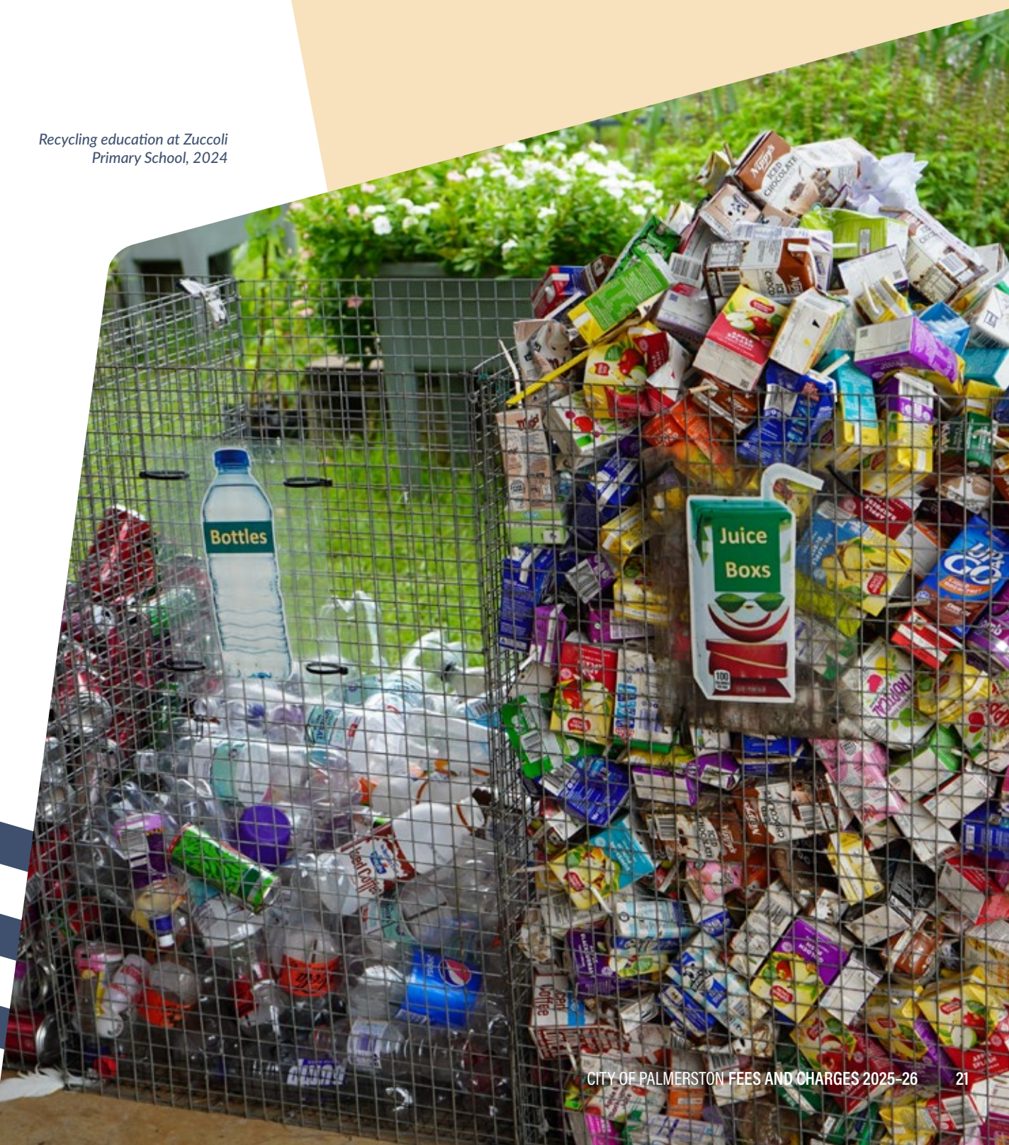
Recycling education at Zuccoli Primary School, 2024