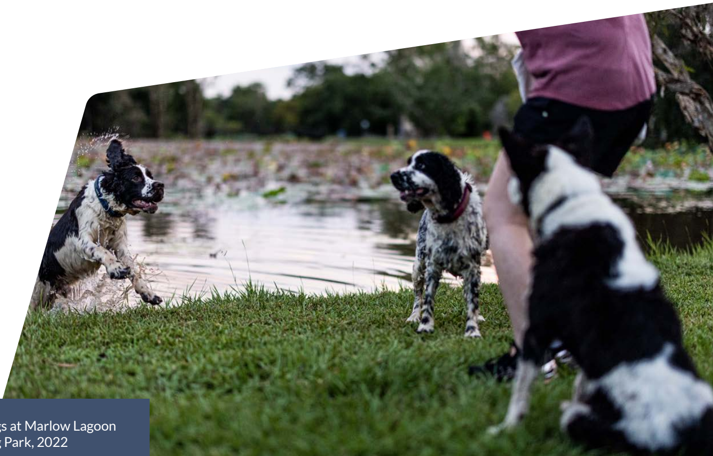
Dogs at Marlow Lagoon Dog Park, 2022