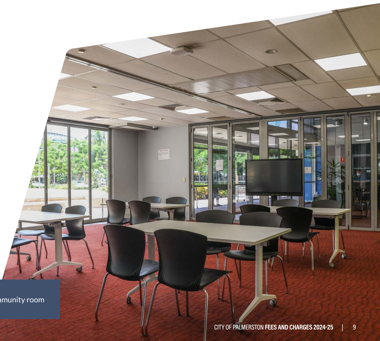
Library community room