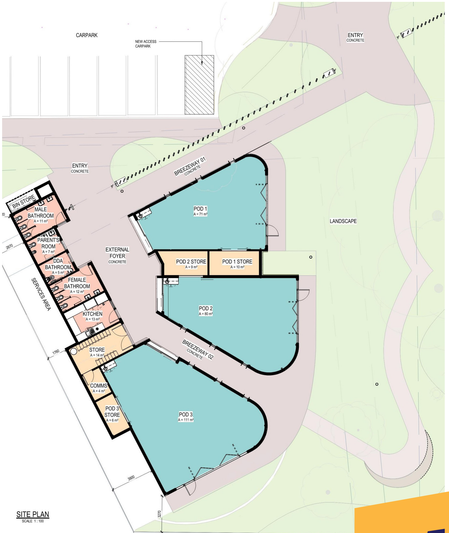
SITE PLAN SCALE 1:100