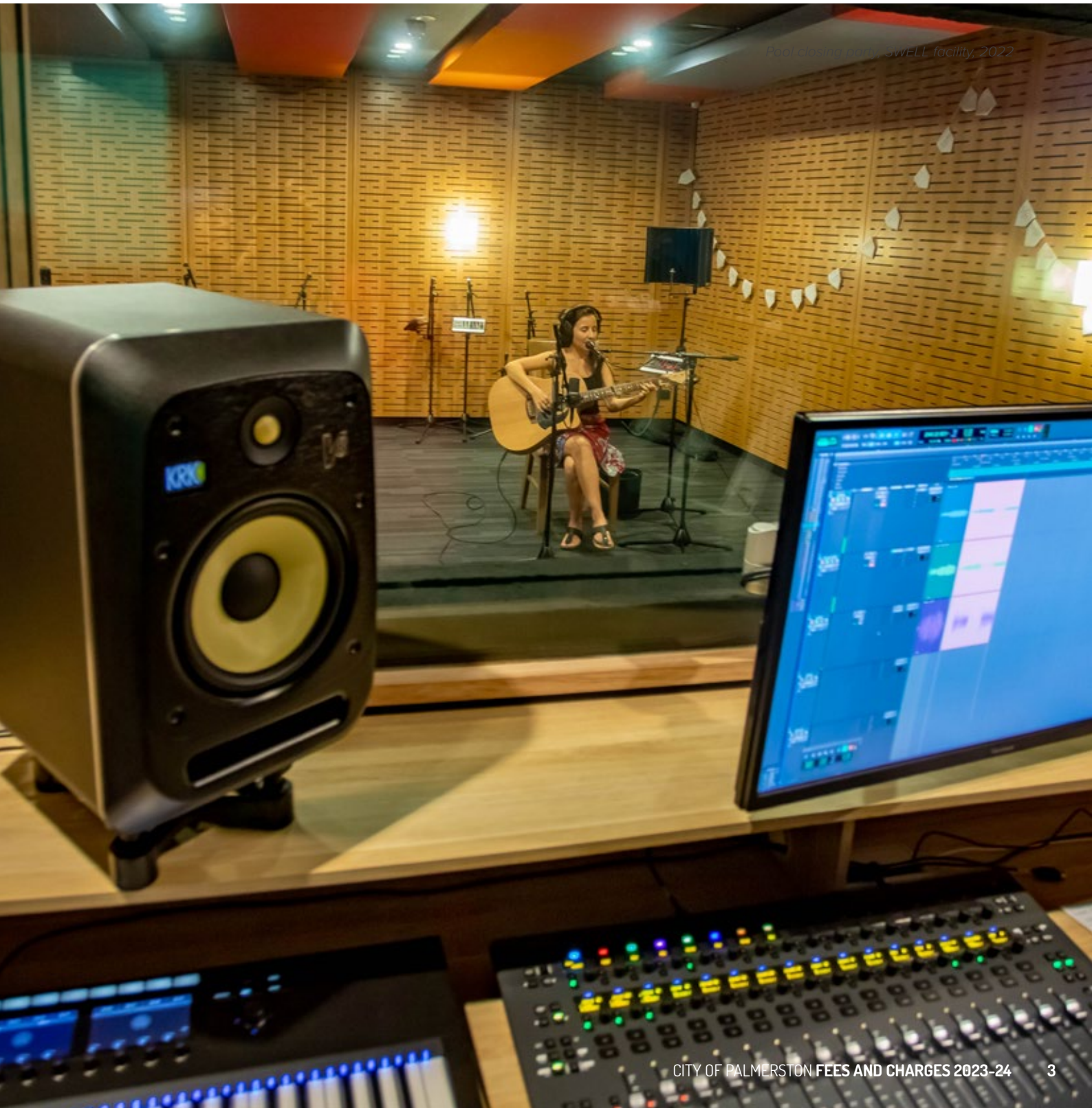
Recording studio, SWELL facility, 2022