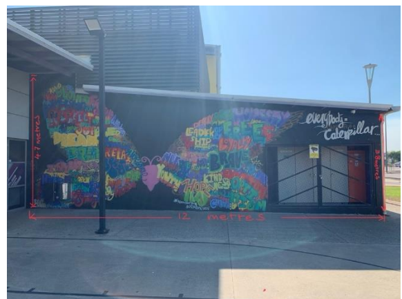
Photos of existing wall